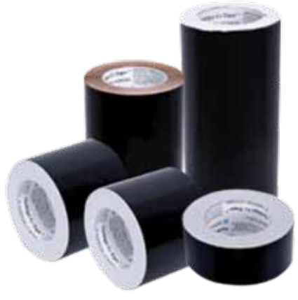
2", 4", 6", 9", 12" Black (3040BK) Permanent