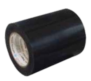
6" Black (BAB0650)